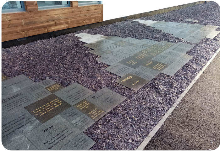
Sponsor names at our state-of-the-art Hockey Centre.