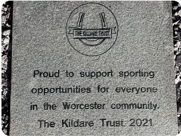
The Kildare Trust stone at the Worcester International Hockey Centre.