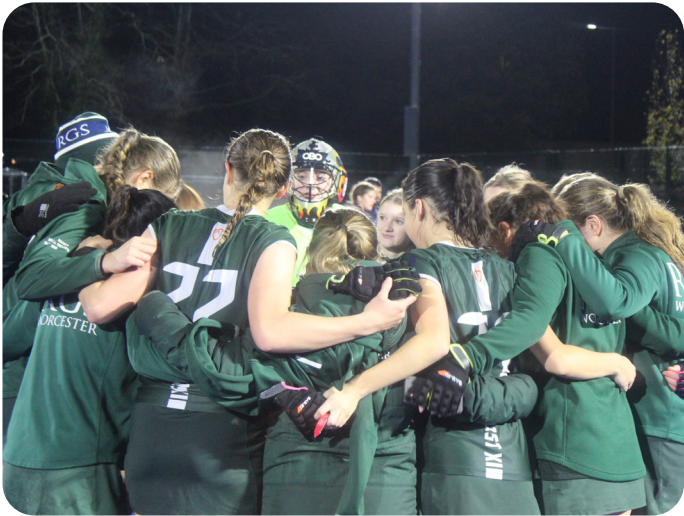
Our Hockey players are playing well and getting huge pleasure from our Hockey Centre.