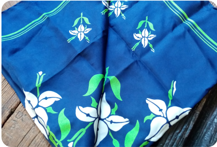
A gift to the Archives from a former pupil of The Alice Ottley School.